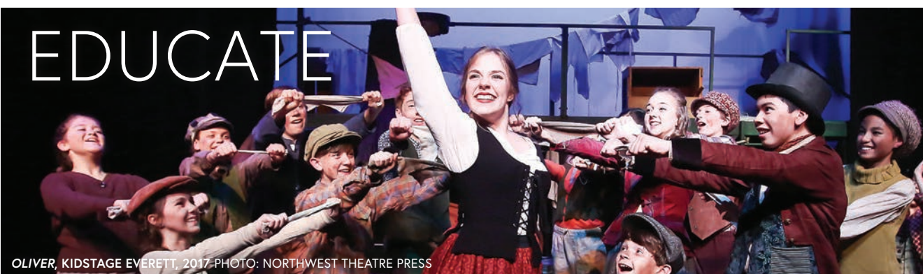
OLIVER, KIDSTAGE EVERETT, 2017