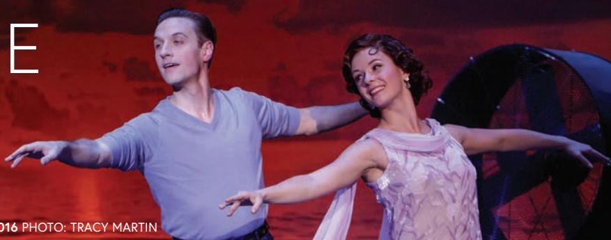
SINGIN' IN THE RAIN, MAINSTAGE, 2016