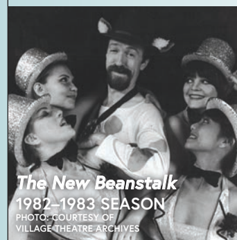
The New Beantalk 1982-1983 SEASON

1982 The first version of KIDSTAGE is created with a student SummerStock program at Issaquah High School.