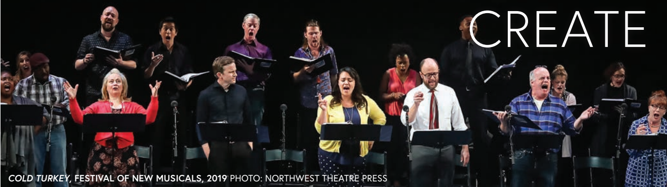
COLD TURKEY, FESTIVAL OF NEW MUSICALS, 2019