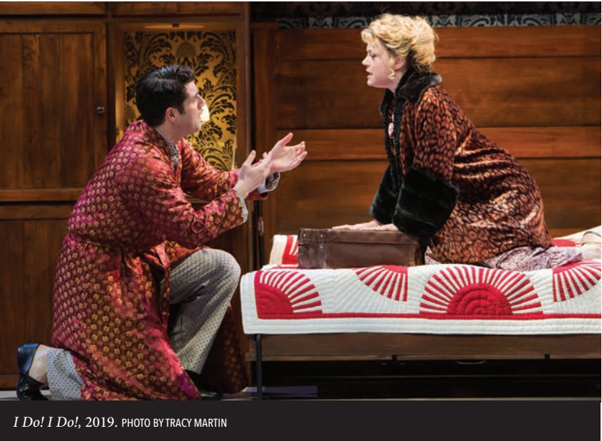
I Do! I Do!, 2019.