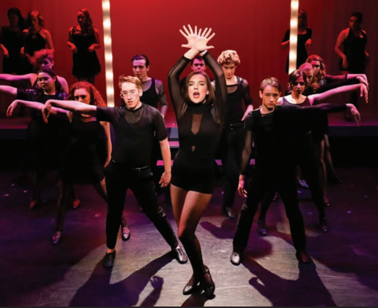
CHICAGO, KIDSTAGE, 2018