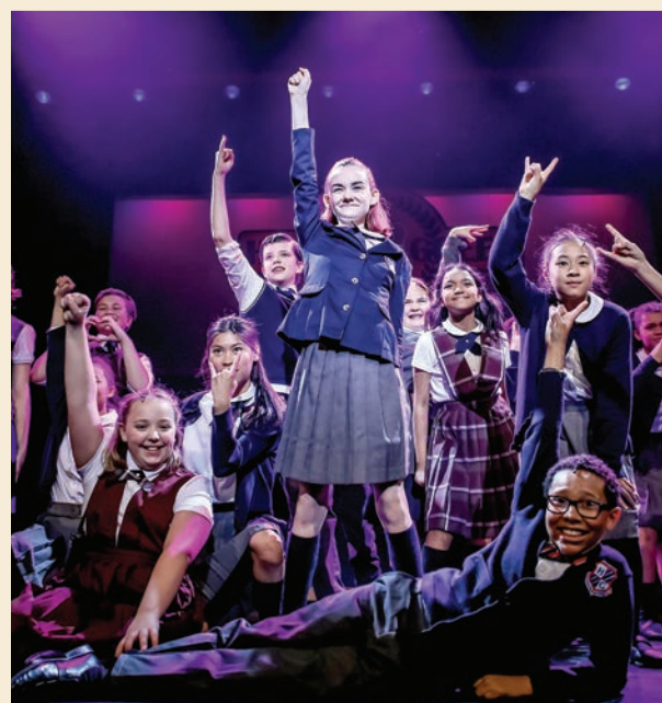
KIDSTAGE: School of Rock, 2019.