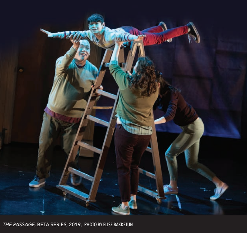
THE PASSAGE, BETA SERIES, 2019

This year's Festival included readings of: XY , a powerful musical about an intersex man dealing with his relationship with his mother and his first romantic relationship; Cold Turkey , a hilarious adaptation of the Norman Lear film of a town in the 1960s in which all the residents quit smoking to try and win $25 million; Modern , a touching story of Amish teens on their coming-of-age journey through the tradition of Rumspringa; Eastbound , a journey through family and culture as one brother seeks his Chinese roots while the other runs away from his own; and Cowboy Bob , a pop-punk country-western story of a woman who would dress up as a man to rob banks, and the Chili's waitress who was inspired to take her life into