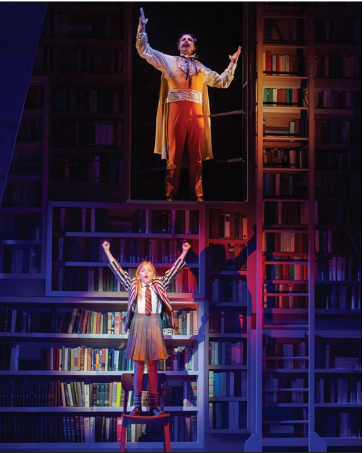
Matilda, 2018.