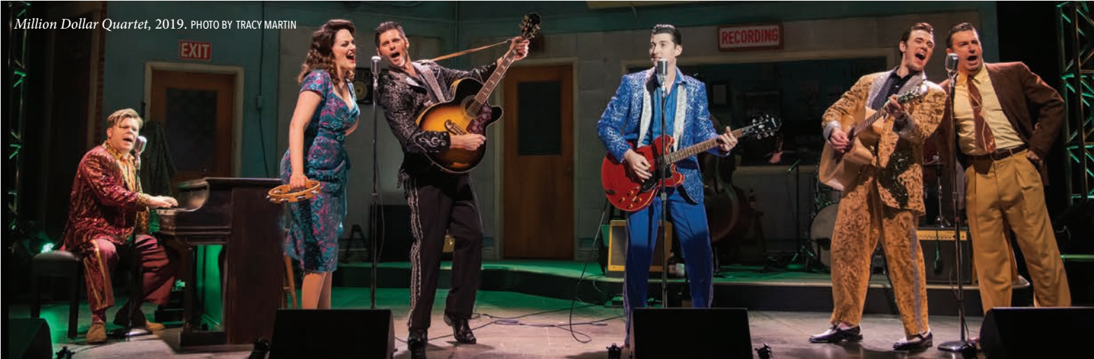
Million Dollar Quartet, 2019.

Named funds within each Endowment category are indicated above in burgundy. All individual donors who made donations to those funds since the inception of the endowment are listed in black below the Endowment category or below the fund if they contributed to the named fund.