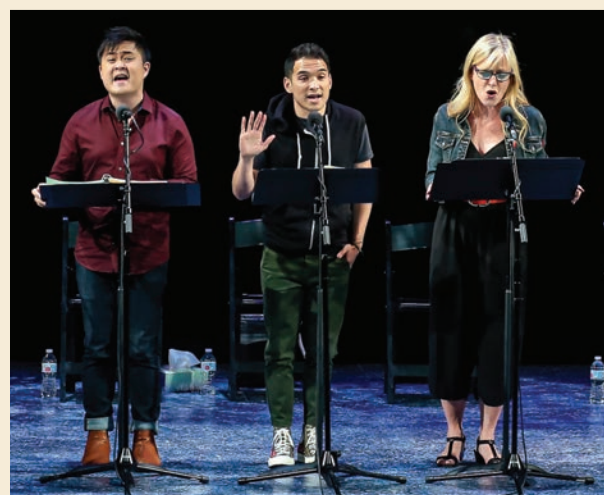
VILLAGE ORIGINALS: Eastbound , Festival of New Musicals, 2019.