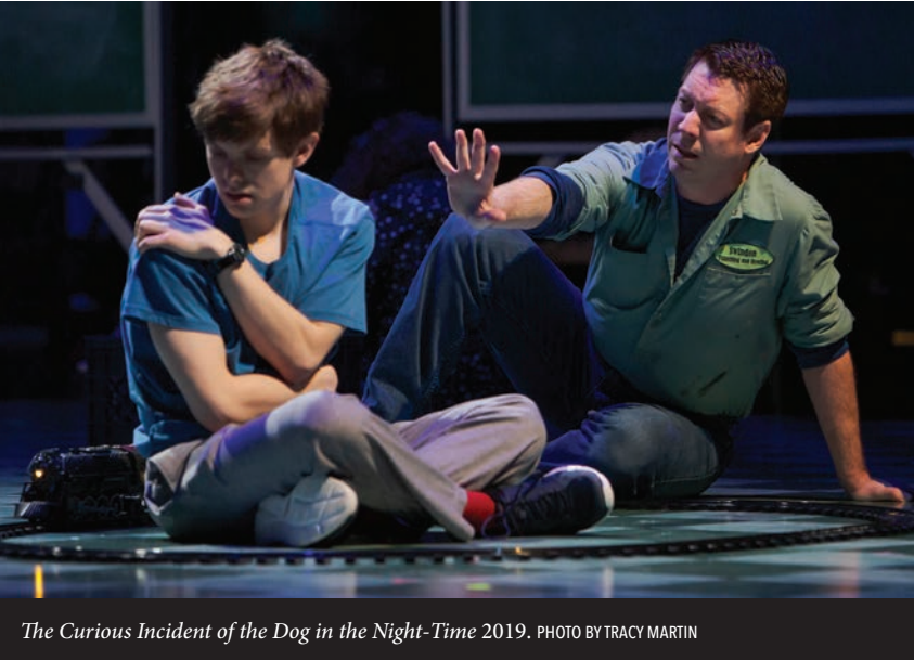
The Curious Incident of the Dog in the Night-Time 2019.