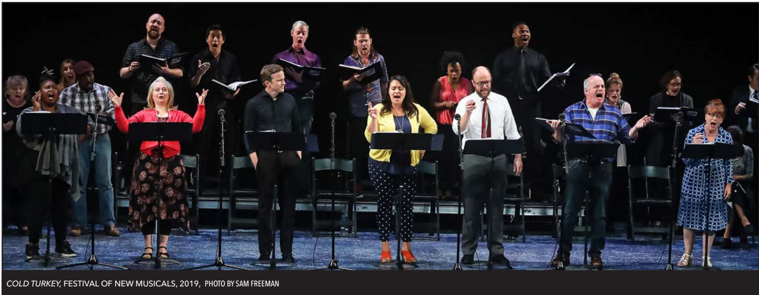
COLD TURKEY, FESTIVAL OF NEW MUSICALS, 2019, PHOTO BY SAM FREEMAN

Beta Series opened with The Passage , a hit from our previous festival, about a boy who creates a magical world of adventure to distract him from the pending death of his father. Second, came an advanced stage reading of The Homefront , a rock musical about women factory workers fighting to keep their jobs after the end of World War II. The final show, Hart Island , tells the heartbreaking story of a mother dealing with the loss of her child and the Rikers Island inmate who helps her grieve and move on.