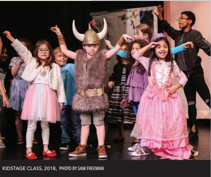
KIDSTAGE CLASS, 2018